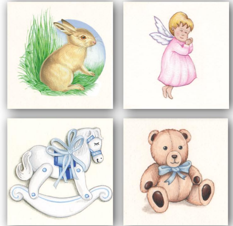
A selection of possible bespoke illustrations