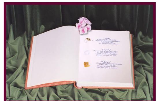
Handbound Book of Remembrance