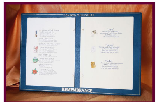
Flat Bed Remembrance Display

3. Flat Bed Remembrance Display - leather covered with gold tooling to outer edge with brass posts for holding loose leaves.